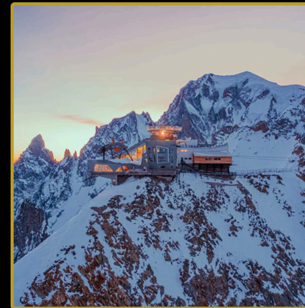
Discover Mont Blanc via Skyway and wild mountain paths, immersing yourself in powerful alpine scenery.