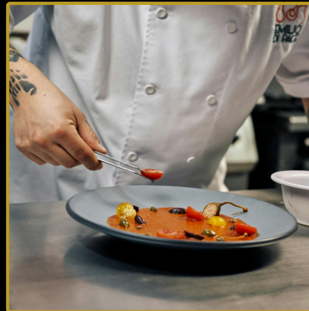
Michelin-starred chef in a private villa with tasting experience