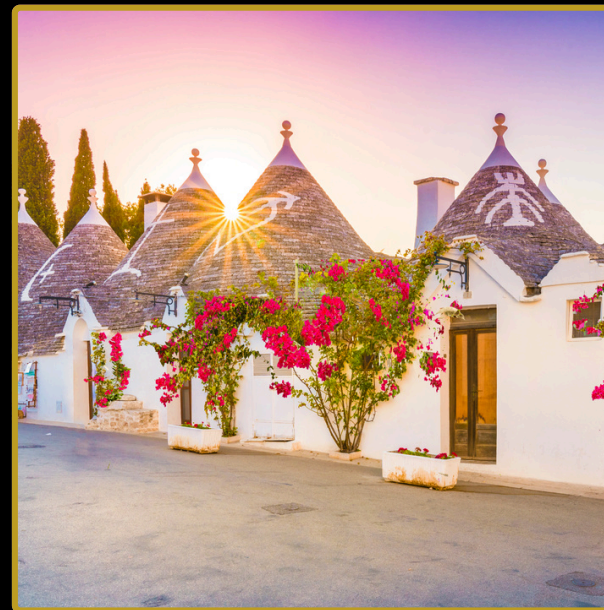
An elevated food journey inside the traditional Trulli of Alberobello, celebrating the authentic flavors of Puglia