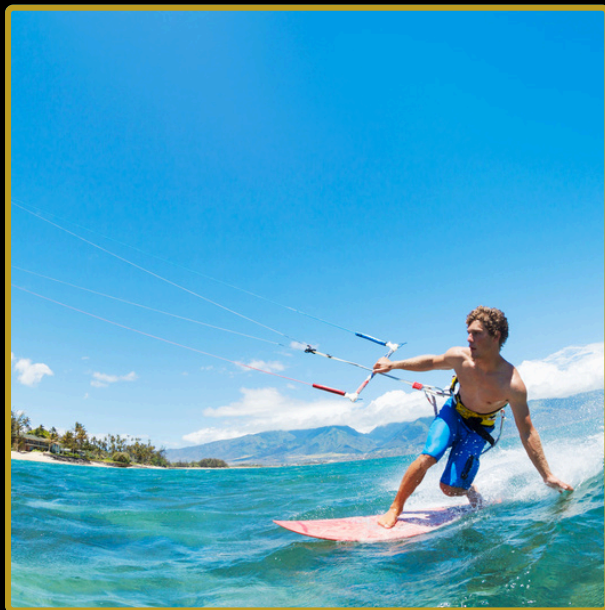
Kite & wind surfing courses in the breathtaking turquoise water of Sardinia