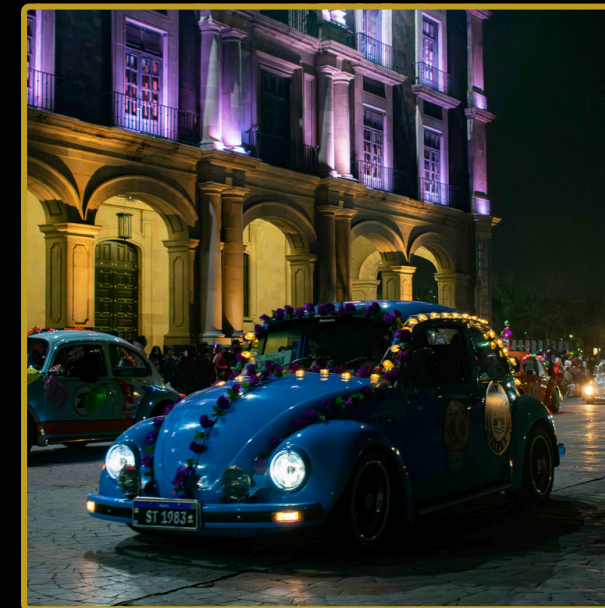
Private night tours by car or Vespa