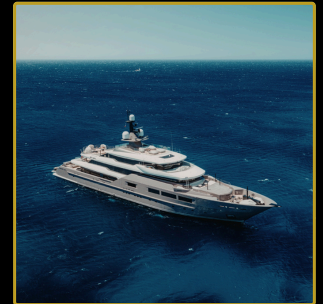
All inclusive Yacht expeditions