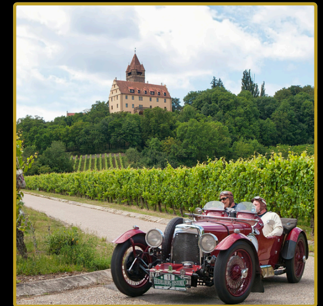
Experience Tuscany's vineyards aboard charming restored vintage cars, enjoying the best of Italian wines.