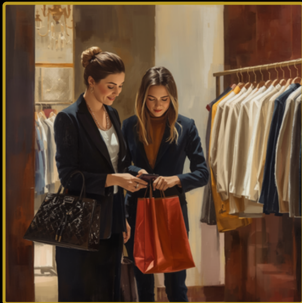
Personal shopper and Made-to-Measure